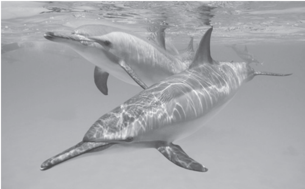
The reefs, resting grounds for the dolphins, are declared a sanctuary and will be closed for all diving and snorkelling activities for one month