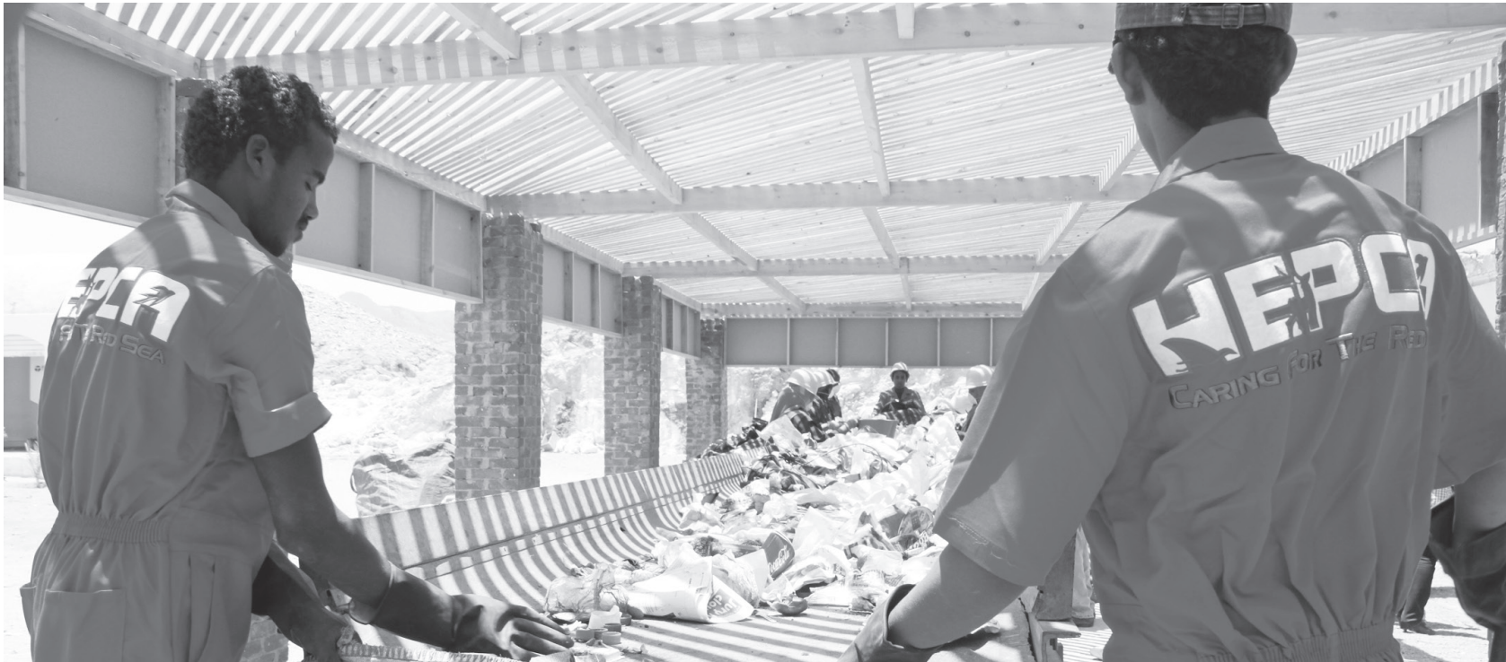
Every day garbage is collected and separated in the solid waste management plant in Marsa Alam