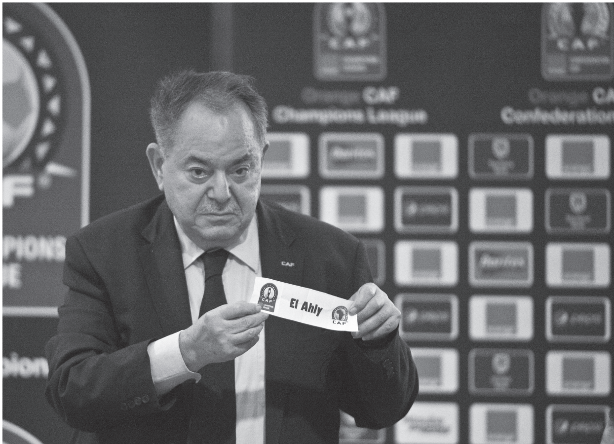
A member of the Confederation of African Football (CAF) shows the name of Egypt's Al-Ahly football team during the CAF Champions League draw in Cairo on Tuesday. Al-Ahly is in group A and will play against local rivals Zamalek

In group A, Ahly managed to overtake Harras El-Hodood with two goals to one. The result kept the league holder at the top of its group with 30 points, four points away from Enppi that defeated Telephonat Beni Suef 1-0 to maintain its second place. Wadi Degla remained at the bottom of the group despite grabbing a 1-0 victory over Misr Al-Makasa. Smouha, holder of the third place, also grabbed a 1-0 victory over Gouna.