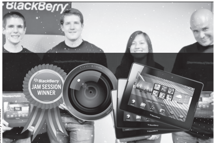
BlackBerry is to hold BlackBerry Jam sessions for app developers in the Middle East and Africa

Smartphone company BlackBerry is planning to launch a new series of BlackBerry Jam Sessions targeting Africa and the Middle East this summer. The initiative offers a training opportunity for developers and young entrepreneurs seeking to improve their skills working with the company's technology.