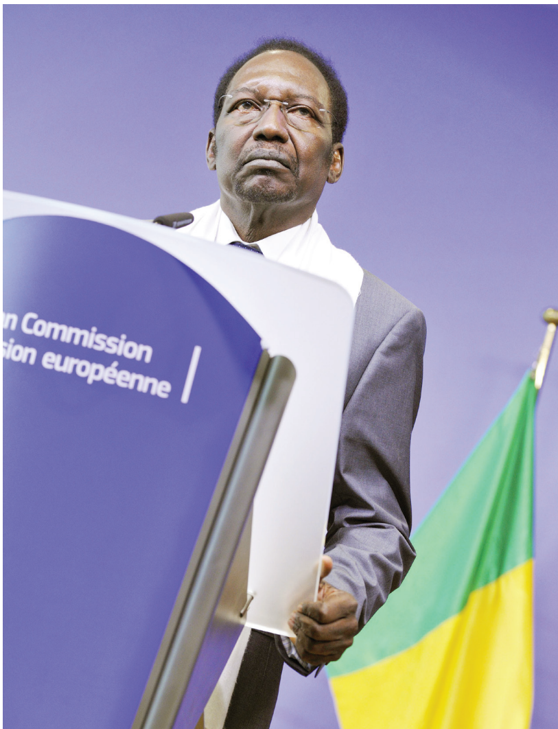
Mali President Dioncounda Traore holds a press conference after participating in the "Donor Conference for Development in Mali" in Brussels

Al-Azhar offered as part of Egypt's support package for Mali