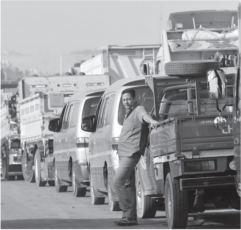
Large queues form around a gas station in Cairo