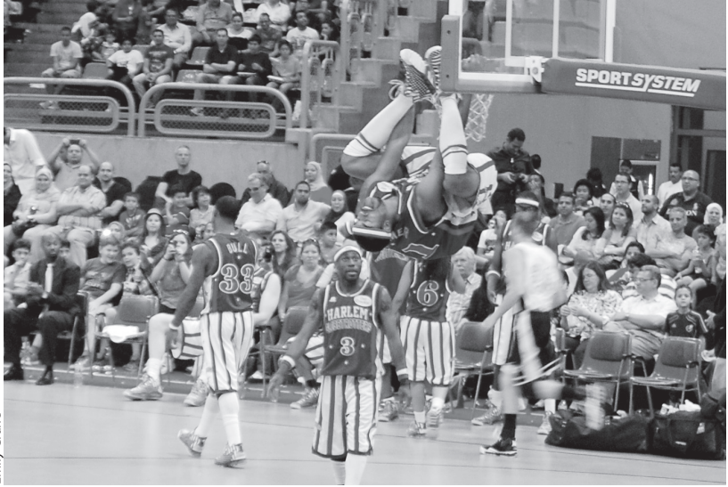
"Hammer" hangs upside down from the hoop during a performance of the Harlem Globetrotters in Cairo International Indoor Stadium on 10 May

"We speak the universal language of basketball," Dizzy said in a press conference last Wednesday. "We try to break down cultural barriers