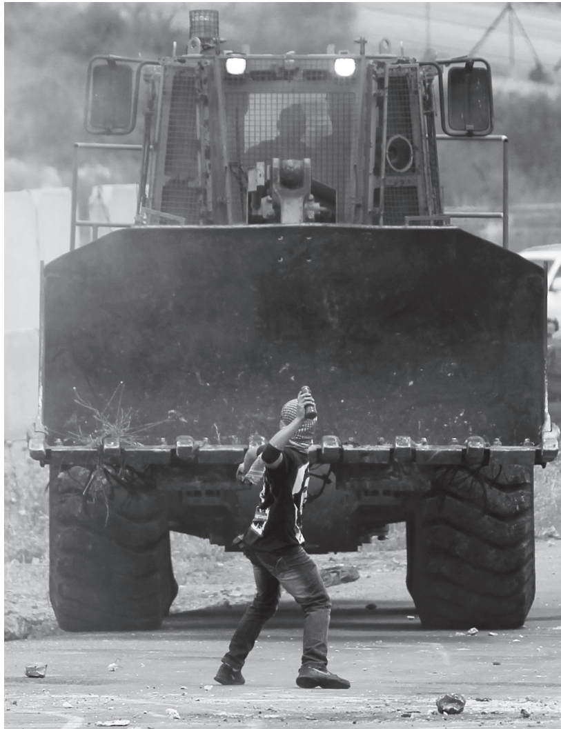
A Palestinian throws a petrol bomb towards a digger of the Israeli army during clashes between Palestinians and Israeli soldiers at the gate of the Ofer prison after a march marking the 65th Nakba Day or "Day of Catastrophe" in the West Bank city of Ramallah.