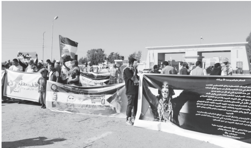
"Crowds on the Borders" convoy carried about 100 passengers to the Rafah Border Crossing to commemorate the 65th anniversary of the Nakba

The convoy called on Fatah and Hamas to achieve reconciliation. "We