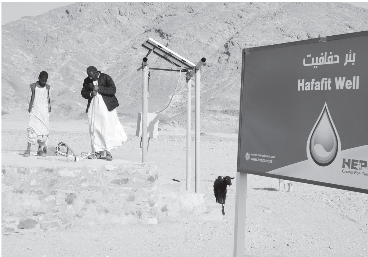
One of the wells dug by HEPCA that provide clean water to the Bedouins that live in the area

The latest problem that HEPCA has tackled with great success is the situation around the reefs Shabb El Erg and Shabb Fanus, reef systems that are well known resting grounds for large groups of dolphins. Every day snorkel boat operators flock to these reefs to give their guests a chance to see and snorkel with dolphins. "We received many reports of the huge amount of boats that would visit these sites simultaneously and the violations they would perpetrate," Amr Ali said. "The boats would chase the dolphins with no regard for the safety of the dolphins or of the divers or snorkelers that were in the water. This has lead to 11 injuries, as well as fatalities, of