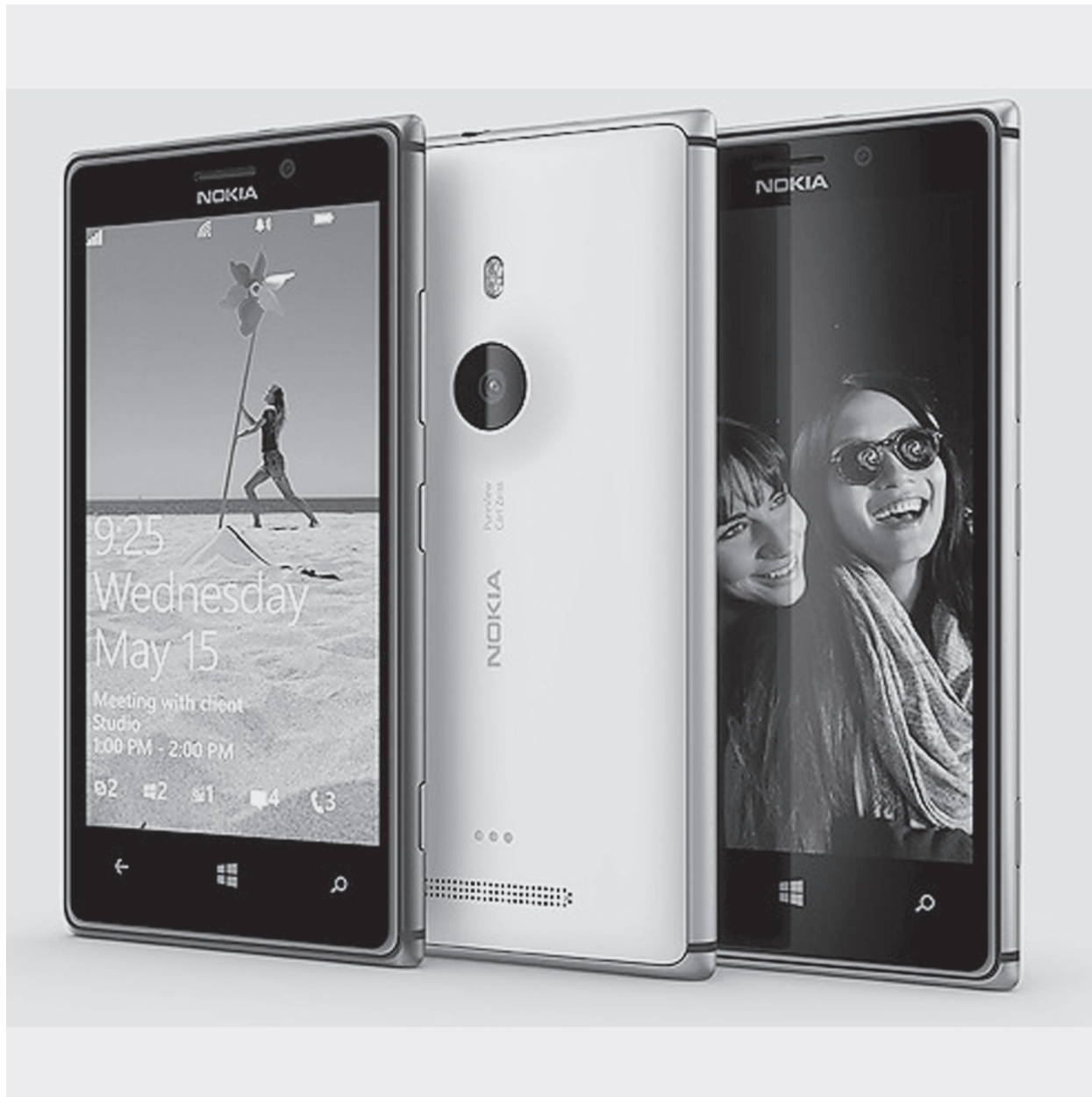
Nokia released its Lumia 925 on 14 May

Lumia 925 also comes with Hipstamatic's new app, as well as Oggil, which allows users to take and share high quality pictures simultaneously.