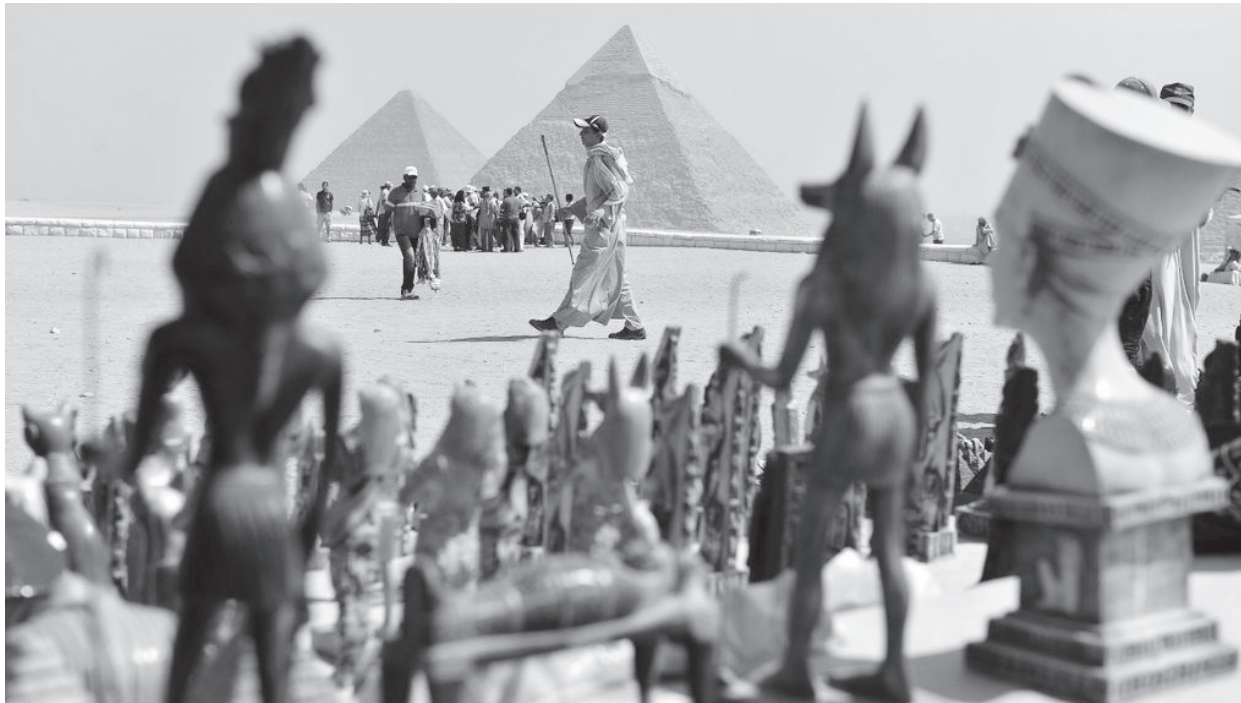
Minister of Tourism Hisham Zaazou claims Egypt has seen a steady rise in tourists over the past year

Iranian tourists, it would bring Egypt between $200m and $250m by the minister's estimation. "Who is going to spread the Shi'a doctrine in Egypt