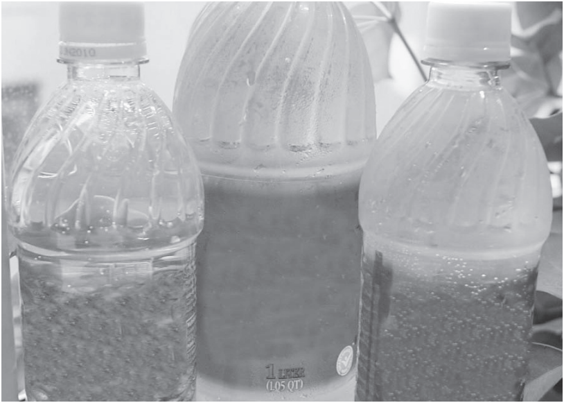
The health minister urged Egyptians to buy water only from licenced companies

The ministry has also renewed its call to close underground wells that are used by some bottled mineral water companies, after it discovered the presence of contaminants and