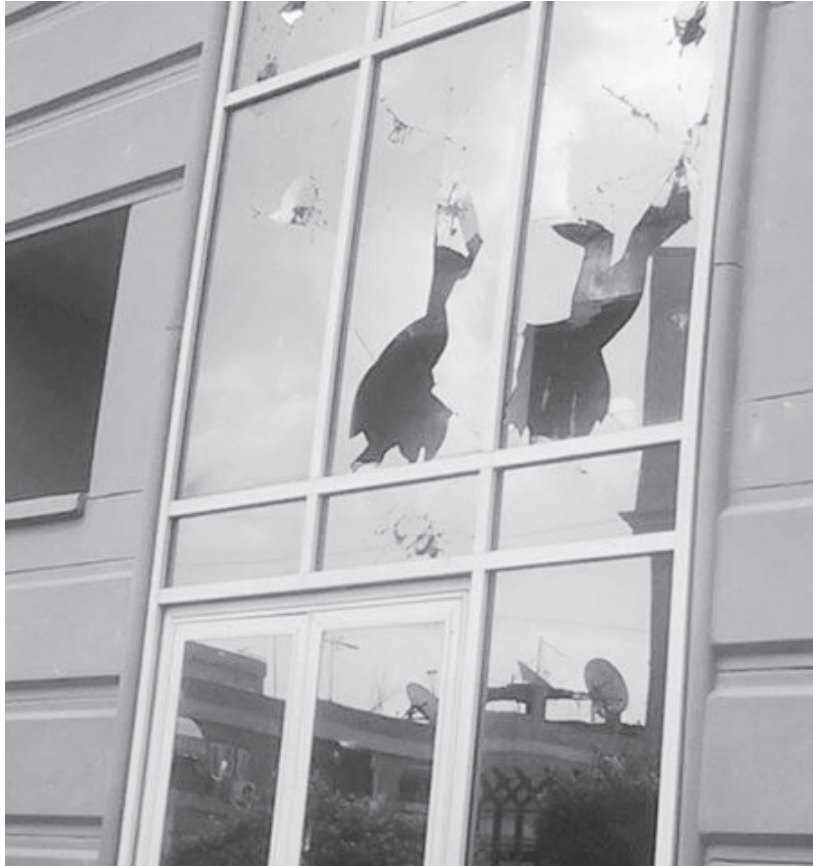
Petrojet Facebook page