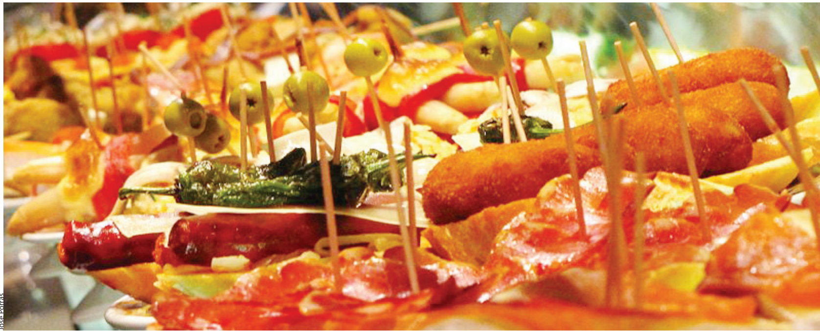
Tapas come in many shapes and forms and are a staple of Spanish cuisine